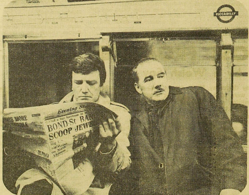
"Gumshoe," at the Futurist from Sunday.